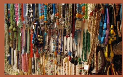
2. Paltan Bazaar

Without visiting this market your journey find Tibetan artefacts, Garhwali jewellery, and prayer flags.