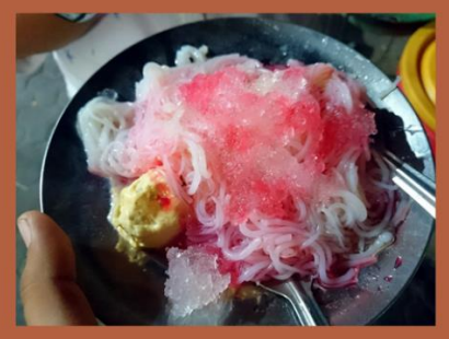
4. Faluda Kulfi

It is an old dish in Garhwal Tribe, which is prepared using black urad dal. It is best served with the rice