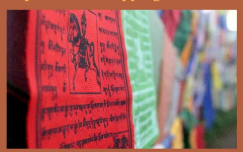
1. The Tibetan Market

Without visiting this market your journey find Tibetan artefacts, Garhwali jewellery, and prayer flags.