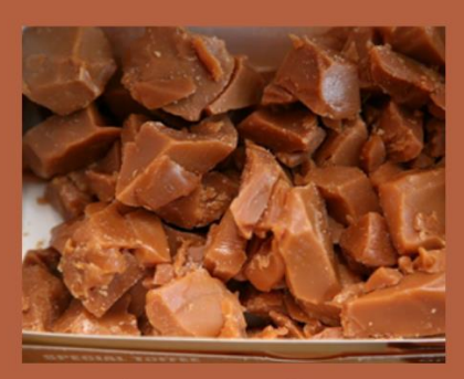
5. Butter Toffees