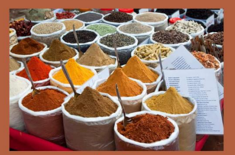
3. Arhat Bazaar

One can find antiques, clothes, Pahari famous for Basmati rice.