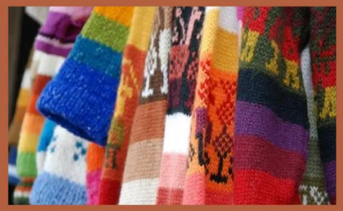
4. Astley Hall

generally crowded and gives a taste of local life.